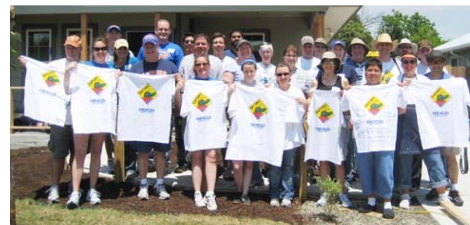
Lone Star Gator Club