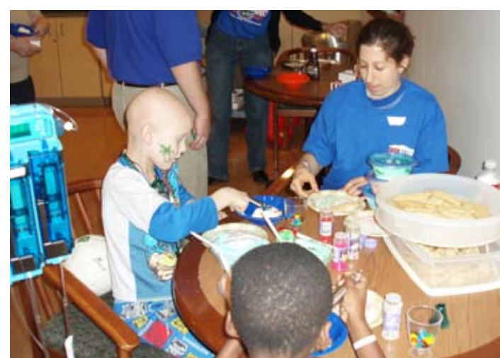
Houston Gator Club