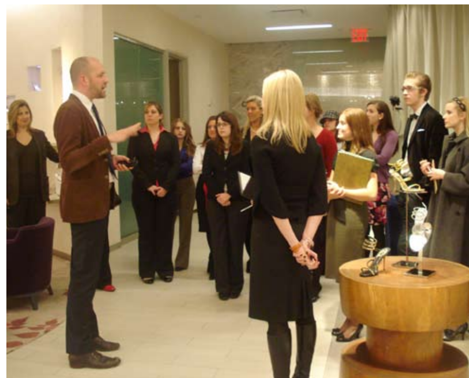
The Saks Fifth Avenue store manager explains the store's design to UF students.